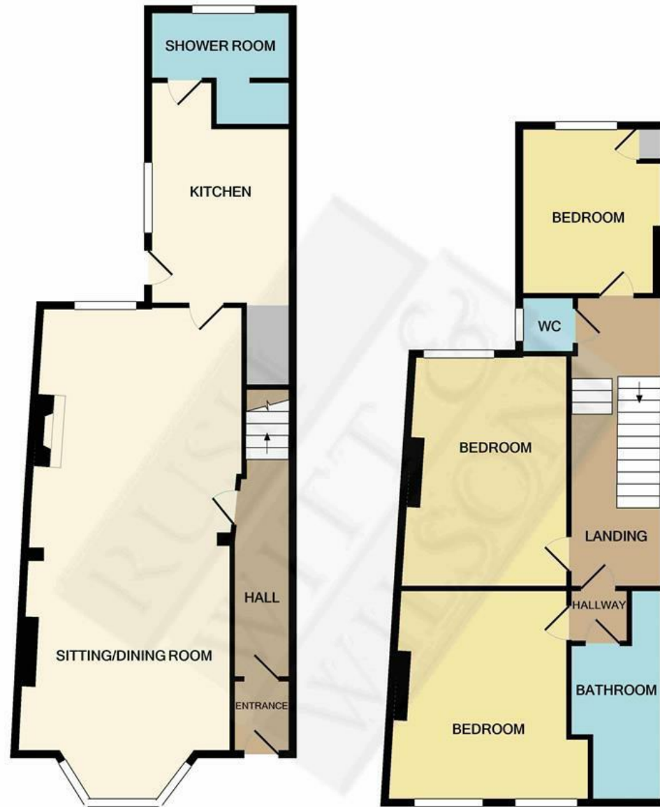
GROUND FLOOR APPROX. FLOOR AREA 616 SQ.FT. (57.2 SQ.M.)